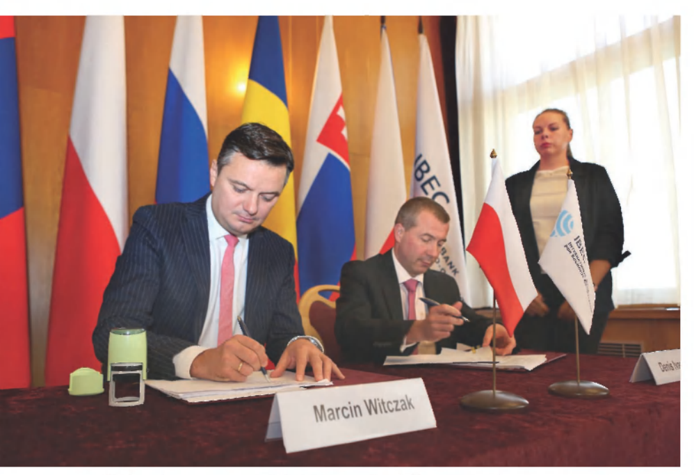
Signing a Ioan agreement with Polish company Laude Smart Intermoda

ing global crisis caused by the COVID-19 pandemic. The financial results of the first half of the year along with investment grade ratings from Fitch (BBB-, positive) and Moody's (Baa3, stable), the highest national scale rating from ACRA (AAA(RU), stable) and rating from the European rating agency ACRA Europe (BBB, stable), confirm the reputation and status of the IBEC as a stable and reliable partner.